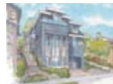
THE STINSON | 4521 Howe Street