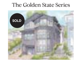
THE TILDEN | 4517 Howe Street

Compass is a real estate broker licensed by the State of California and abides by Equal Housing Opportunity laws. License Number 01527235. All material presented herein is intended for informational purposes only and is compiled from sources deemed reliable but has not been verified. Changes in price, condition, sale or withdrawal may be made without notice. No statement is made as to accuracy of any description. All measurements and square footages are approximate. This is not intended to solicit property already listed.