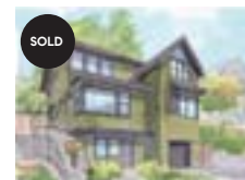
THE PRESCOTT | 4523 Howe Street