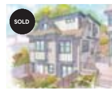
THE YOUNTVILLE | 4519 Howe Street